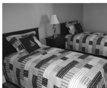
Left: Third floor twins room and second floor elevator lobby.