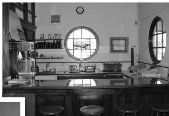
Aloha Café Counter.

Between the months of May and July, special events for donors and the public will be scheduled to celebrate all the changes at Seamen's. We all are certainly looking forward to a well deserved Campaign Closing Party!