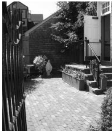
A previous summer in the Memorial Garden.

teachers in Newport County public schools. It was wonderful to see so many new and creative faces!