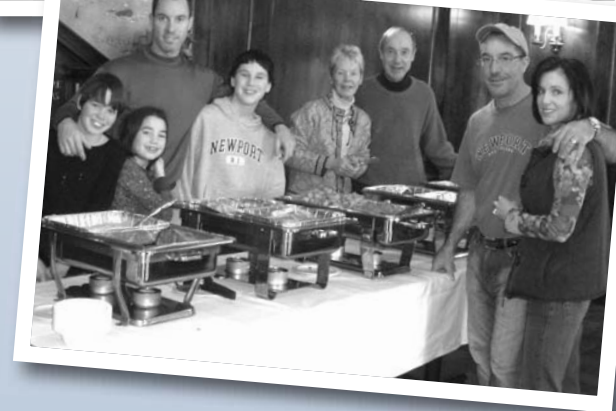
(TOP) Christmas morning was shared with area residents who joined us for breakfast.