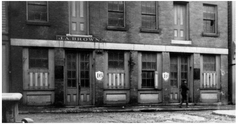
The 18 Market Square site purchased by benefactors Edith & Maude Wetmore.

For 90 years, fulfilling the mission of Seamen's Church Institute has been possible because of the caring and generous support of so many individuals, organizations and businesses from throughout the community, State, and all parts of the world. We strive to do what we can, with what we have, where we are – and often receive a note to show that we are, in fact, continuing to make a difference.