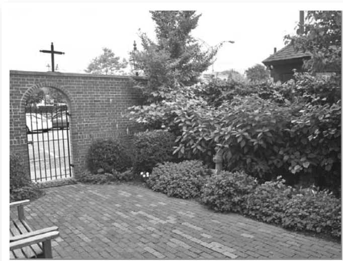
The Memorial Garden at the Seamen's Church Institute.