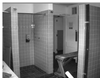
(ABOVE) Looking into former bathrooms from Bowen's Wharf; digging the pit for elevator supports.